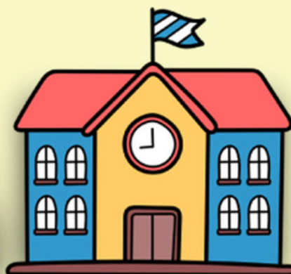
The Mall School

ent for all families joining the school. meet the teacher' evening for parents. gs for children.