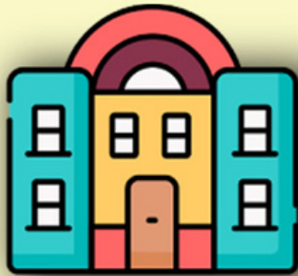
The Mall Nursery

All children at The Mall Nursery automatically receive an offer of a place in The Mall School. Nursery families have lots of opportunities to visit the main school and get to know the staff and facilities there